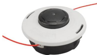
Nylon head Autocut 46-2